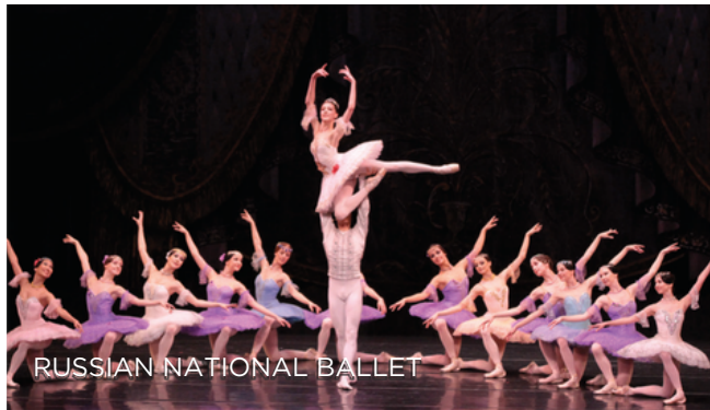
RUSSIAN NATIONAL BALLET