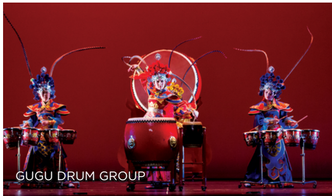
GUGU DRUM GROUP