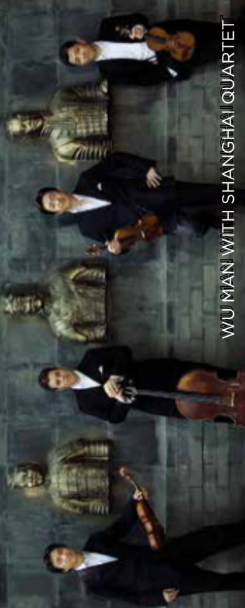
WU MAN WITH SHANGHAI QUARTET

US Postage Org Paid Permit 373 Portland, Maine