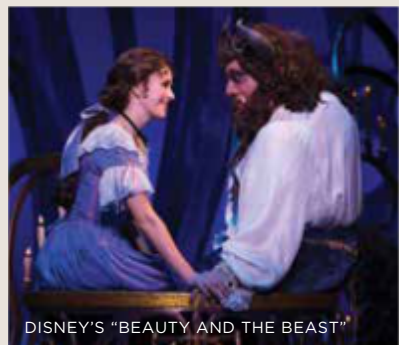
DISNEY'S "BEAUTY AND THE BEAST"

To purchase tickets call PortTIX at 207.842.0800 or visit portland