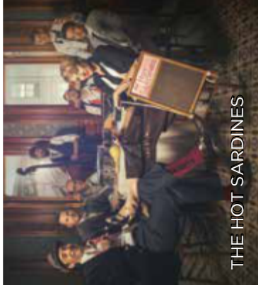
THE HOT SARDINES