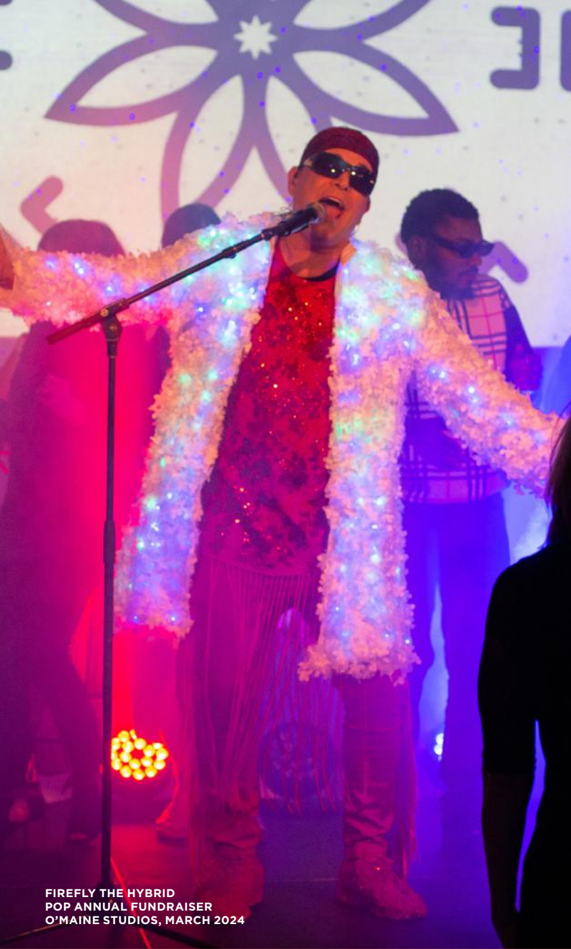
FIREFLY THE HYBRID POP ANNUAL FUNDRAISER O'MAINE STUDIOS, MARCH 2024