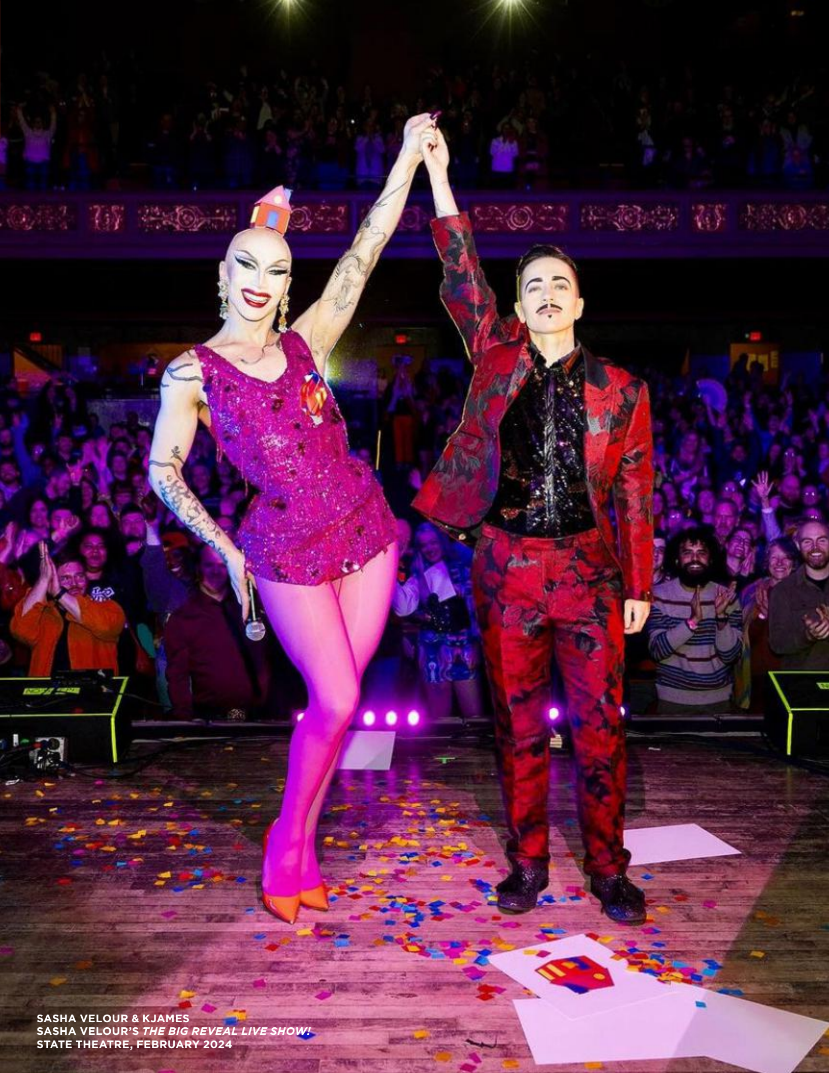
SASHA VELOUR & KJAMES SASHA VELOUR'S THE BIG REVEAL LIVE SHOW! STATE THEATRE, FEBRUARY 2024