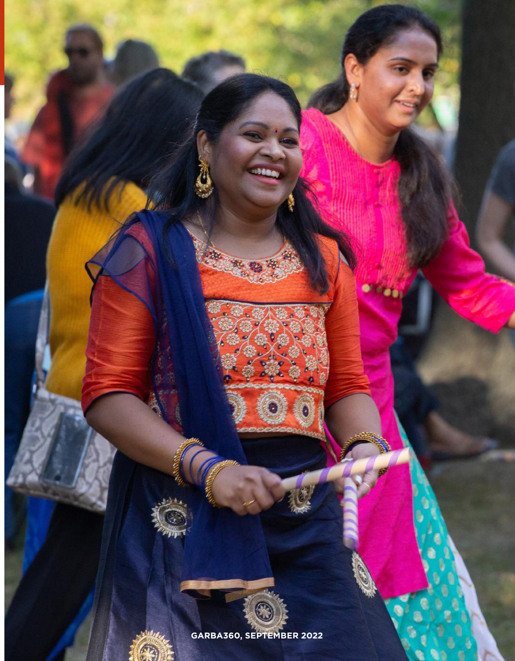
GARBA360, SEPTEMBER 2022