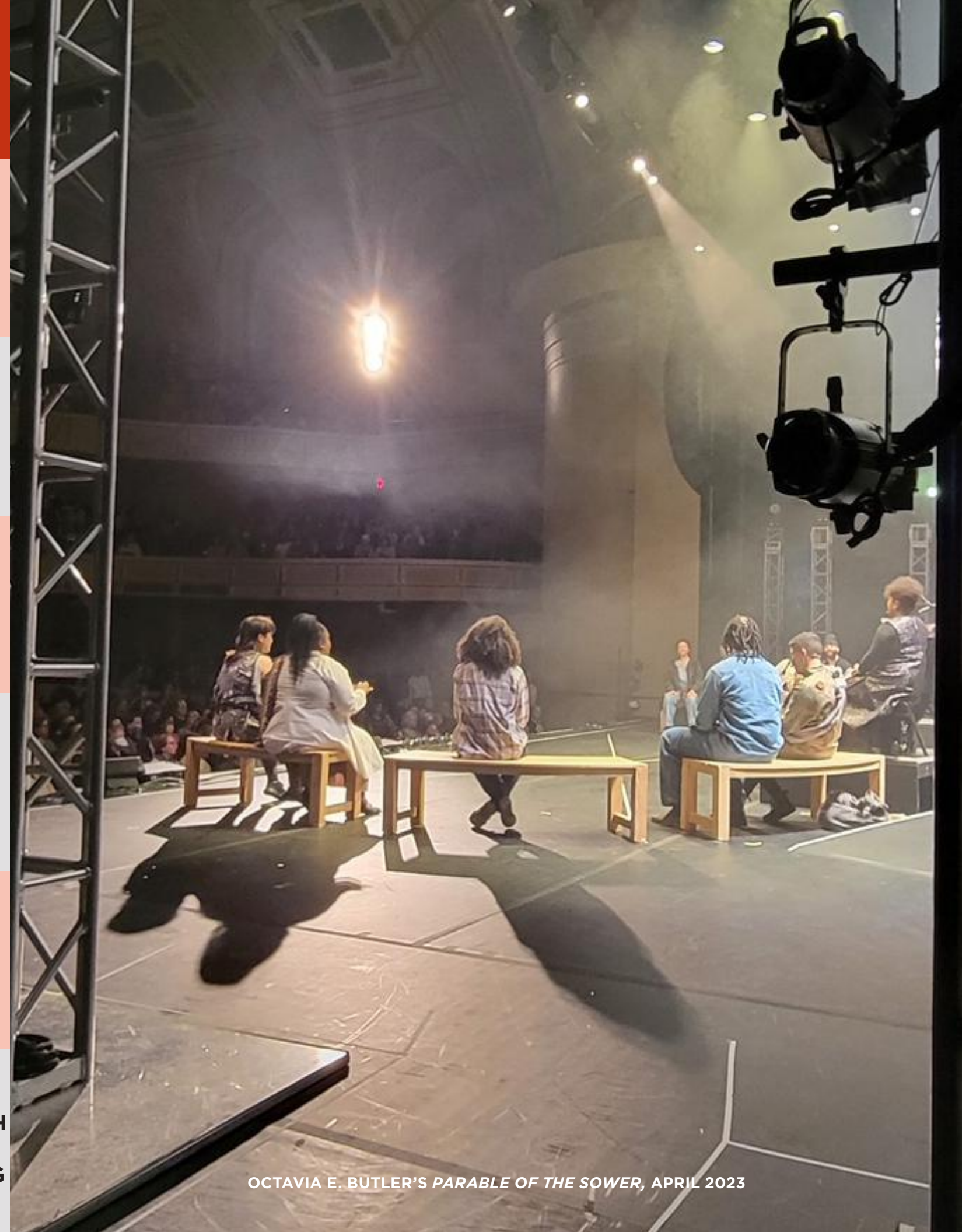
OCTAVIA E. BUTLER'S PARABLE OF THE SOWER , APRIL 2023