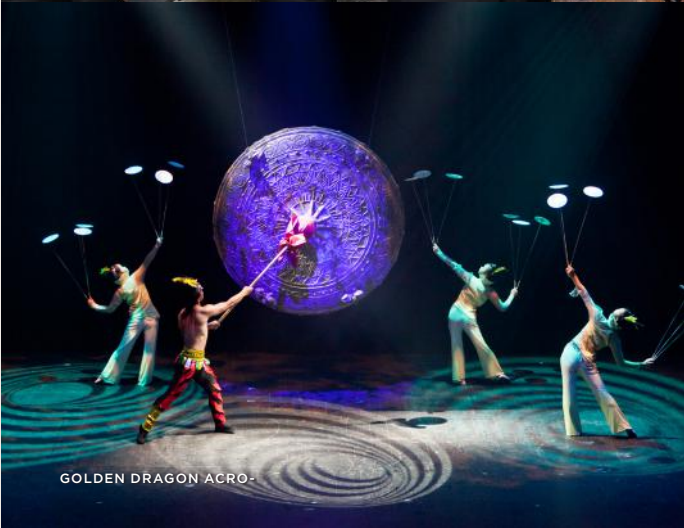
GOLDEN DRAGON ACRO-