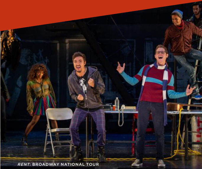
RENT: BROADWAY NATIONAL TOUR

OF BRINGING LIVE PERFORMANCE TO PORTLAND