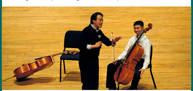
Yo -o Ma during a masterclass in 2009

Raise your digital paddle for a level in one or more of our reverse auction items and take home that great feeling of knowing you've directly funded innovative new performing arts programs for Maine students wherever they are; or support for Maine artists as they continue to innovate and create new work in these challenging times. In a reverse auction, every bid is a winner. We can all contribute to the programs that "inspire a curious and imaginative community where the experience of the performing arts is a vital part of everyday life." Every gift creates real impact throughout the performing arts community in Maine.