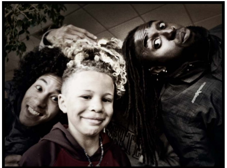
Companhia Urbana De Danca, 2016