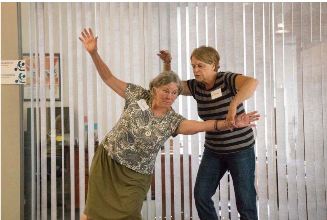
"I Love My Little Storybook" Professional Development for Educators, 2017

https://artskc.org/repository/2013/02/Arts-Cultural-Comp-Worksheet.pdf (worksheet)