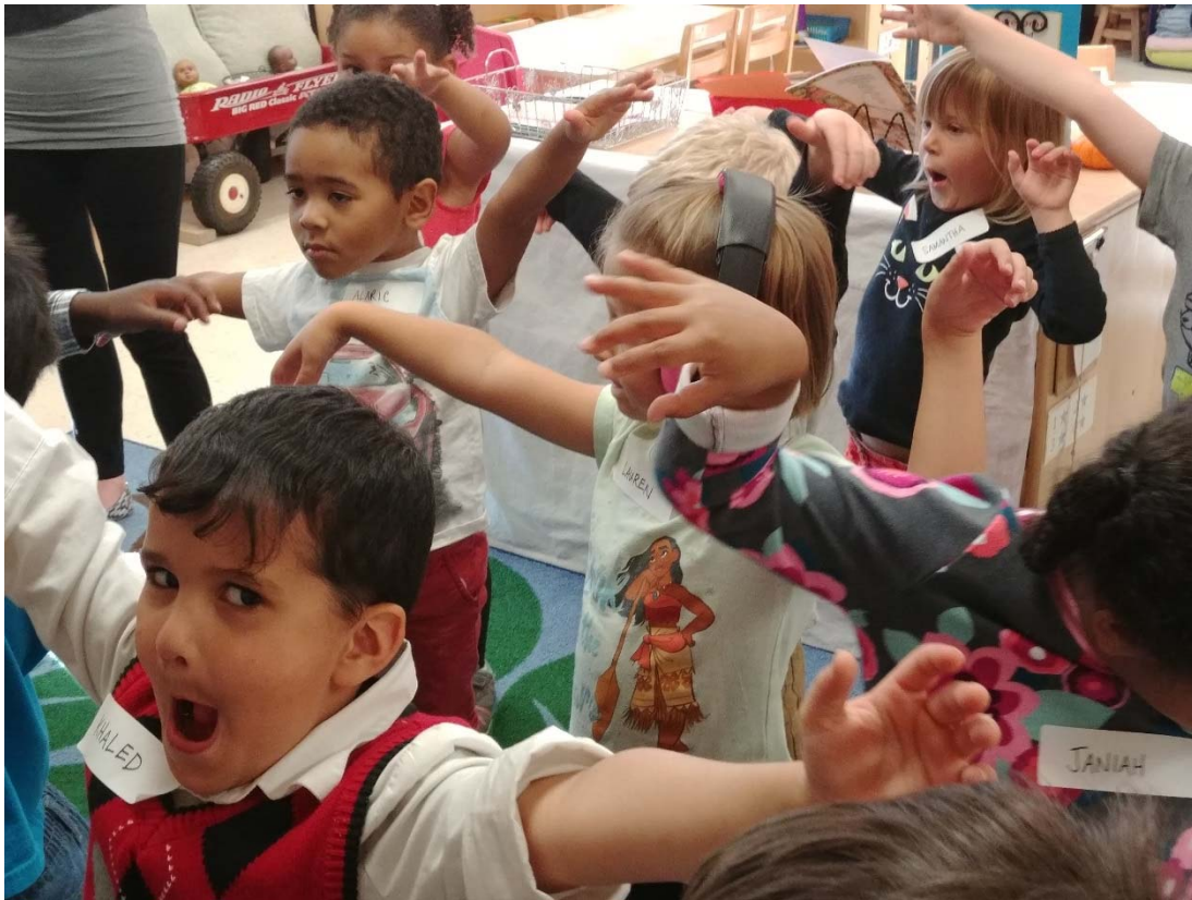
Pre-kindergarten in-school workshop at Kaler Elementary in South Portland, 2017